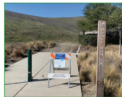
Rancho San Ramon Park Access Point