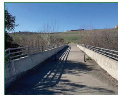
Old Dougherty Road Access Point

and surface maintenance. Our newest trail, Quail Run Trail, is approximately 1.1 miles long and can be accessed either from the Old Dougherty Road Trail, Rancho San Ramon Park, or the Dougherty Valley Ridge Trail. For additional information on our trails and open space, visit www.sanramon.ca.gov/parks .