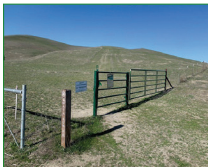
Looking up towards the Dougherty Valley Ridge Trail Access Point from Dougherty Road

S pring is upon us, and with the warmer weather brings the opportunity to enjoy the City of San Ramon Trails and Open Space network. The Trail network consists of approximately 45 trails; that’s over 50 miles of rolling hills, vistas, and beautiful scenic views to enjoy. Trails are either fully landscaped with shrubs, trees, and ground cover, or partially landscaped with shrubs and trees that blend into the natural surroundings. The Public Services Division is responsible for maintaining most of the trails and open space throughout the City, with safety for all users being the main focus and guiding principle. Trail maintenance is scheduled annually for most trails and consists of vegetation management, weed abatement,