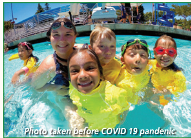
Photo taken before COVID 19 pandemic

The highlight of the Spring & Summer Recreation Guide is our Summer Camp and Aquatics sections. Like last summer, all camp programs will follow the current County Health Guidelines to ensure the safety of campers. With over 275 summer camp offerings, we welcome the return of some of our most popular camps including Bay Area Children's Theatre, Star Guards, tennis, and more. Camp information is available online at www.sanramon.ca.gov/camps . Register at www.sanramonrecguide.com .